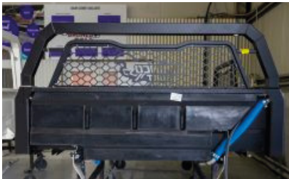
Headboard 36L water tank From $905 + GST