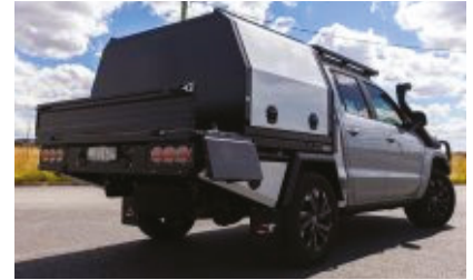
Sectioned sideboards From $480 + GST per side