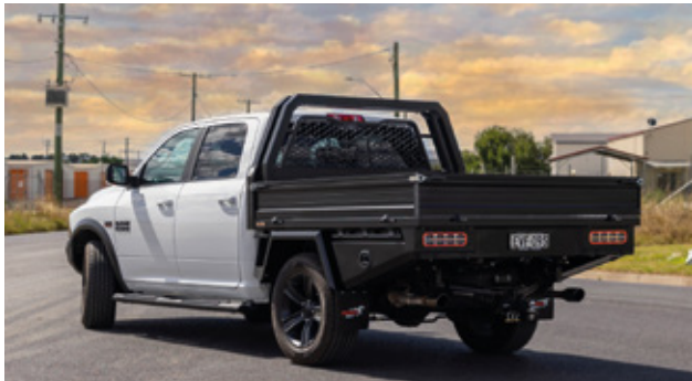
V5 Steel Tray From $6,550 + GST