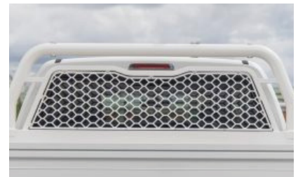
Standard "Honeycomb" mesh Standard inclusion