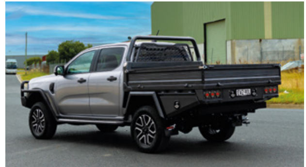
V4 Alloy Tray From $7,400 + GST