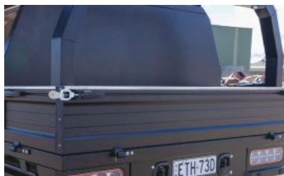
Stainless Steel sideboard capping From $350 + GST