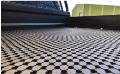
Rubber matting From $245 + GST