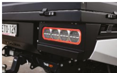
LED Taillights Standard inclusion