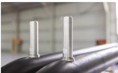
Load spikes From $115 + GST (set of 4)