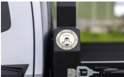
Integrated headboard fuel filler Standard inclusion