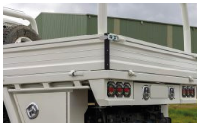
Sideboards & tailgate Standard inclusion