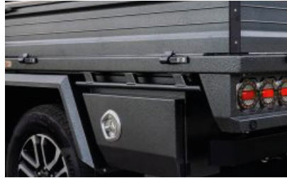
Rope Rails From $480 + GST