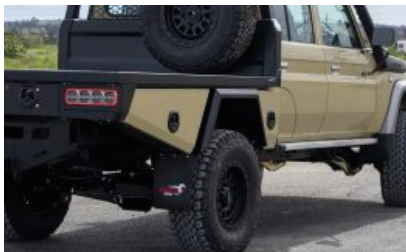
One-piece flared mud guards From $150 + GST, fitted (each)