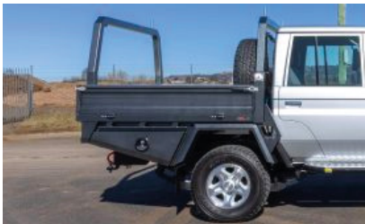
"RHS" style ladder rack From $850 + GST