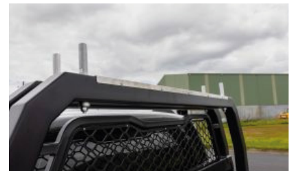
Stainless Steel protective headboard capping From $130 + GST each