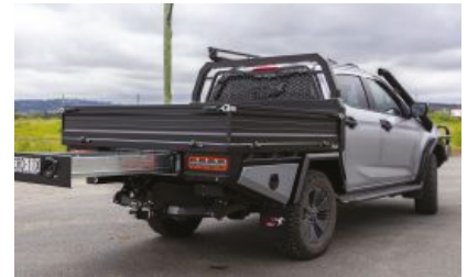
Deep-sealed drawer From $1,650 + GST