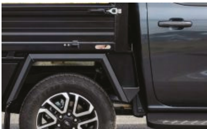
Front infill side steps From $215 + GST (each)