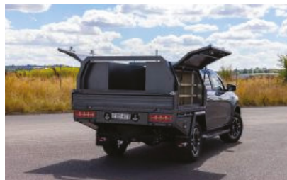
Top tray toolbox From $2,290 + GST (each)