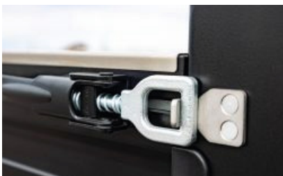
Adjustable over-centre latches Standard inclusion