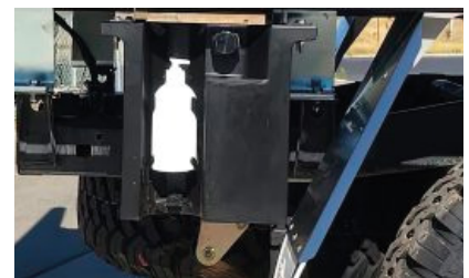
Water tanks - side mounted or under tray From $255 + GST, fitted (each)