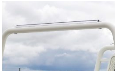
Load bar protector From $130 + GST each