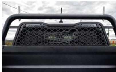
V5 "RHS" style headboard with mesh Standard inclusion