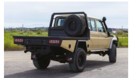
Headboard spare tyre holder From $320 + GST (each)