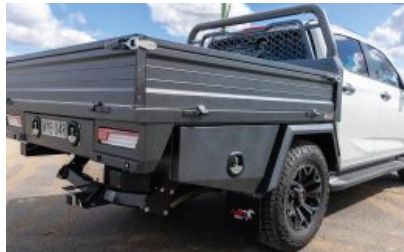
V5 "Integrated" toolboxes From $905 + GST, fitted (each)