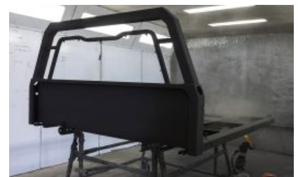
Double-powder coated finish Standard inclusion