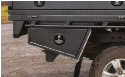
V3 "Tapered" Toolbox From $535 + GST, fitted (each)