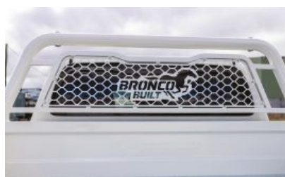
3" V3 pipe headboard with mesh Standard inclusion