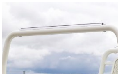
Load bar protector From $130 + GST each