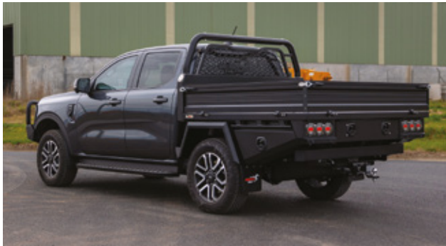
V4 Steel Tray Starting from $6,175 + GST