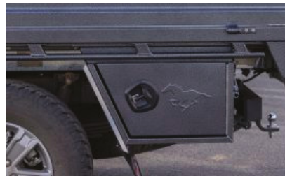
V3 "Flat Bottom" Toolbox From $490 + GST, fitted (each)