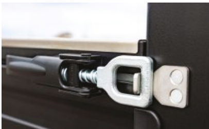
Adjustable over-centre latches Standard inclusion