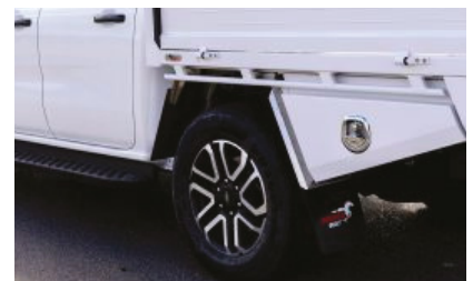
Stainless steel mud guards Standard inclusion