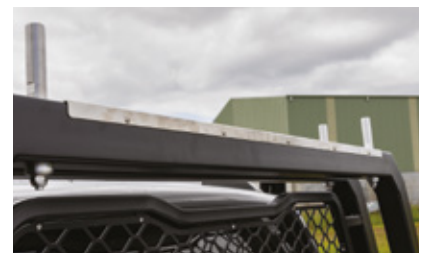
Stainless Steel protective headboard capping From $130 + GST each