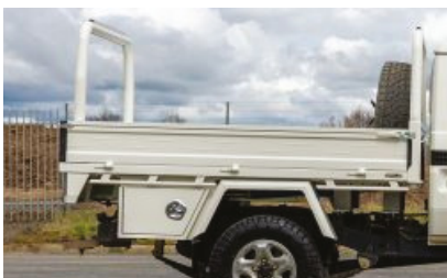
Ladder rack From $585 + GST