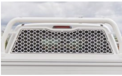
Standard "Honeycomb" mesh Standard inclusion