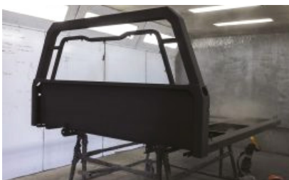
Double powder-coated finish Standard inclusion