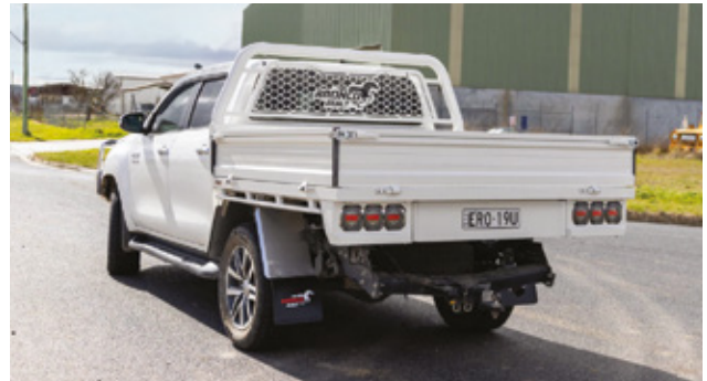
V3 "Standard" Tray Package Starting from $6,430