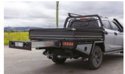
Deep-sealed Toolbox From $1,650 + GST