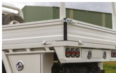
Sideboards & tailgate Standard inclusion