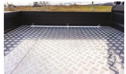
3mm Checkerplate floor Standard inclusion