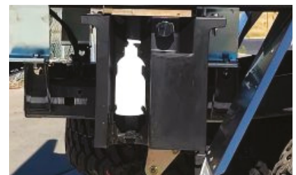
Water tanks - side mounted or under tray From $255 + GST, fitted (each)