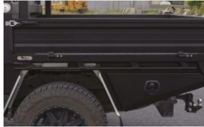
Rope Rails From $480 + GST each