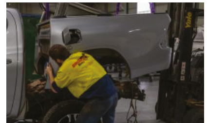
Vehicle preparation Standard inclusion