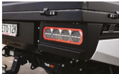
LED Taillights Standard inclusion