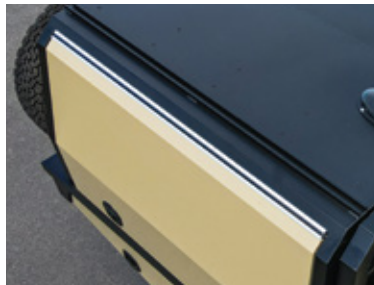
Sealed "CentaFlex" hinge Standard inclusion