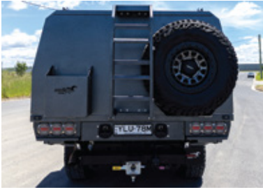
Spare tyre mount From $320 + GST (each)