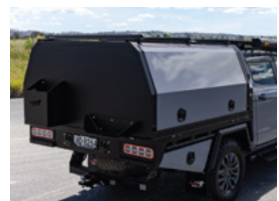
"Rhino Rack" crossrails From $640 + GST