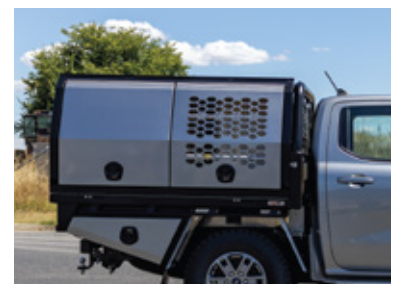
Split canopy doors From $1,330 + GST