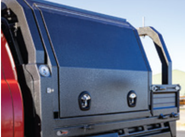
Double powered-coated finish Standard inclusion