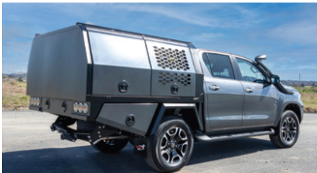
Service Bodies From $15,655 + GST