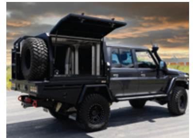
Gull wing doors Standard inclusion