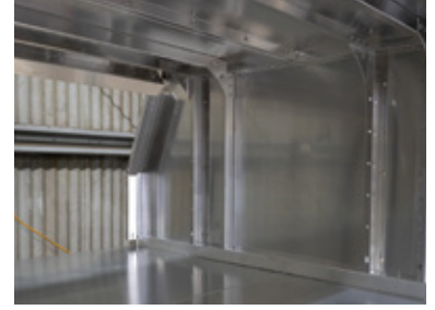
Heavy-duty internal structure Standard quality