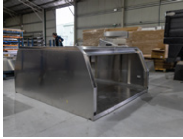
2.5mm Flat aluminium Standard material