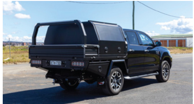
V5 "Premium canopy" Package From $17,720 + GST