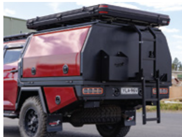
Fold Down Ladder From $660 + GST