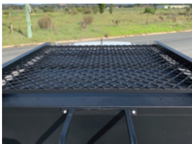
Mesh base on builders rack From $270 + GST