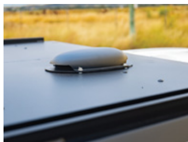
Muller vent From $65 + GST