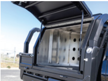
Gas strut-assisted opening of doors Standard inclusion