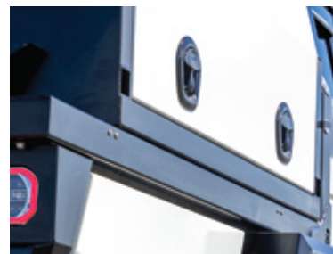
Lift on/off compatible Standard inclusion