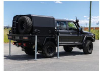
Jack on/off legs $1,280 + GST