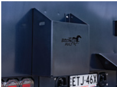
Jerry can holder From $320 + GST (each)