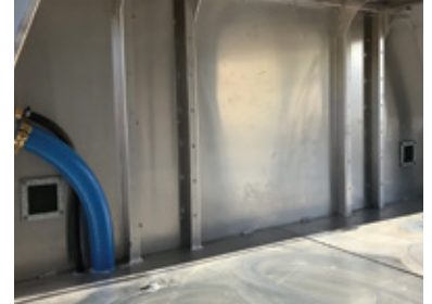
2x louvre vents Standard inclusion