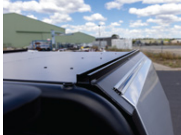
Canopy-top rails Standard inclusion