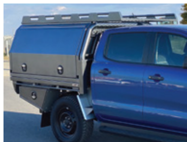
Builders rack From $1,280 + GST