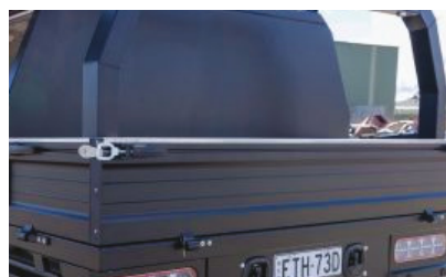
Stainless Steel sideboard capping From $350 + GST