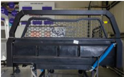
Headboard 36L water tank From $905 + GST