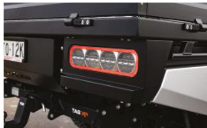
LED Taillights Standard inclusion