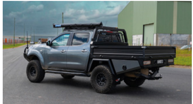
V5 Alloy Tray From $7,990 + GST