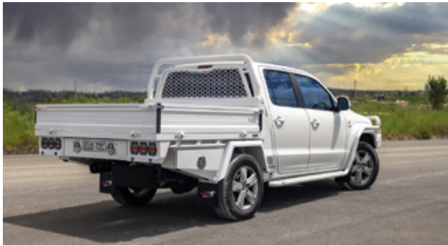
V4 Steel Tray From $6,175 + GST