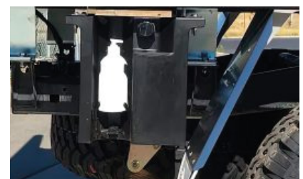
Water tanks - side mounted or under tray From $255 + GST, fitted (each)